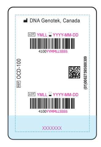
New 8 pt