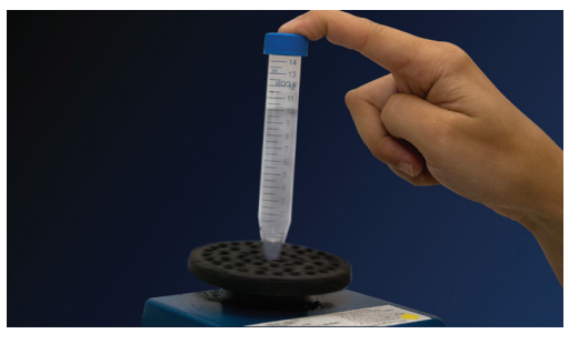
Figure 6 : Vortexing the sample for 30 seconds will allow you to recover DNA smeared on the side of the tube. The DNA will remain high molecular weight.

For ORAcollect products, rehydrate the DNA by adding 0.2 mL of TE solution and vortex the sample for 30 seconds.