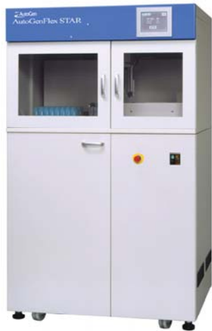
Figure 1 . AutoGenFlex instrument.

Due to its non-invasiveness and simplicity of use, the Oragene DNA Self-Collection Kit enables the convenient collection of samples from large numbers of subjects. The Oragene kit collects 2 mL of whole saliva, which mixes with 2 mL of Oragene DNA-preserving solution inside the kit (4 mL total sample volume). The purpose of this study was to assess the DNA yield and quality of Oragene samples purified with the AutoGenFlex.